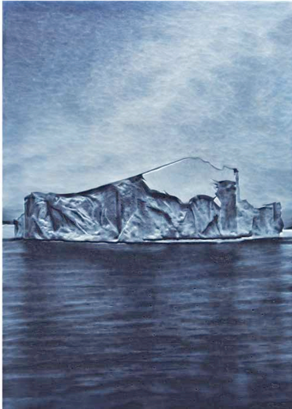
4 Portrait of an Iceberg, Gerlache Strait, Western Antarctic Peninsula (triptych), cameo engraved glass, 18 7 / 8 x 29 1 / 8 x 3 3 / 4 ".